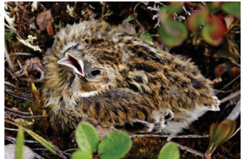
Lapland longspur nestlings (top) and fledgling (bottom)