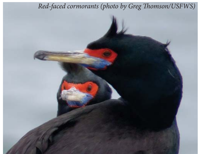
Red-faced cormorants

This summer the team will be working out in the far western Aleutians at Attu and Agattu islands, collecting seabirds for a coordinated series of field and laboratory studies designed to investigate how seabirds are reacting to environmental change and increased ship traffic. Using sophisticated genetic and isotopic analysis, they have been able to show that the ecological patterns are becoming more variable and less predictable. Ingestion of microplastics and their chemicals is becoming more common—probably related to increased shipping traffic, but the actual effects are not well known. Other species, like murres and shearwaters, seem to be doing fine in some regions, while other species seem to be increasing. This year's work will be the end of their first phase of research and after analyses done this summer, we will know a lot more about the effects of change in our Aleutian environment and be able to understand better how to plan for the future.