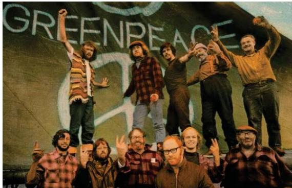
Did you know Greenpeace was formed in 1971, when activists set sail for Amchitka to protest the nuclear tests? Their boat was intercepted by the USCG, and the tests proceeded.

The Department of Energy (DOE) will have staff, along with the University of Alaska Fairbanks and the Aleutian Pribilof Island Association, passing through Adak. They will be conducting radionuclide sampling of the marine environment (fish, kelp, sea water, etc.) around Amchitka and Adak via the R/V Qualifier 105 . Note the sampling around Adak is strictly for reference and there is no concern over an impact to Adak resources from radionuclides. This is part of the DOE's five-year plan for monitoring radionuclides related to the underground nuclear detonations that occurred on Amchitka in the 1970s.