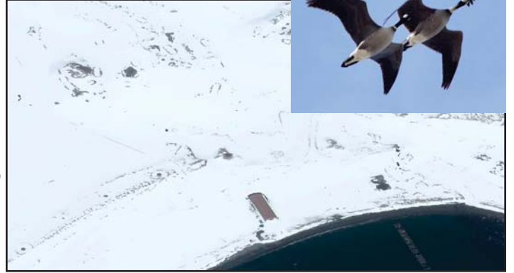
The start of the Attu project may be delayed due to snow coverage; this satellite image from mid-April shows drifts almost up the roof of the old USCG warehouse. Crews will evaluate the conditions upon arrival and do what they can to prepare the camp and clear the runway.

The US Army Corps of Engineers (USACE) and their Contractor, Bristol Environmental Services, will be conducting a cleanup of spilled petroleum and site investigations on Attu Island. Crews will stage in Adak and fly a chartered aircraft between Adak and Attu as the weather allows; the aircraft will remain on Attu for the duration of the project. The initial camp crew will arrive in Adak on 28 April and travel to Attu aboard the landing craft, Sam Taalak , while others in the work crew will be in and out of Adak throughout the month of May and into early June. Besides the USACE and their contractors, representatives from the Alaska Department of Environmental Conservation, the US Army, and media will also be onsite, and a USFWS representative will likely be present for the duration of the cleanup project.