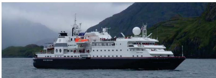
Cruise Ship Silver Discoverer coming to port in Adak. The luxury cruise starts at $28,000 per passenger.

For candidacy information for ACDC contact ACDC's office at 592-2335.