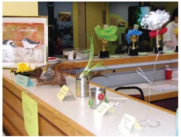
Other Trash Art: shoe vase, spider friends, trash garden, can pencil holder, and can flower.