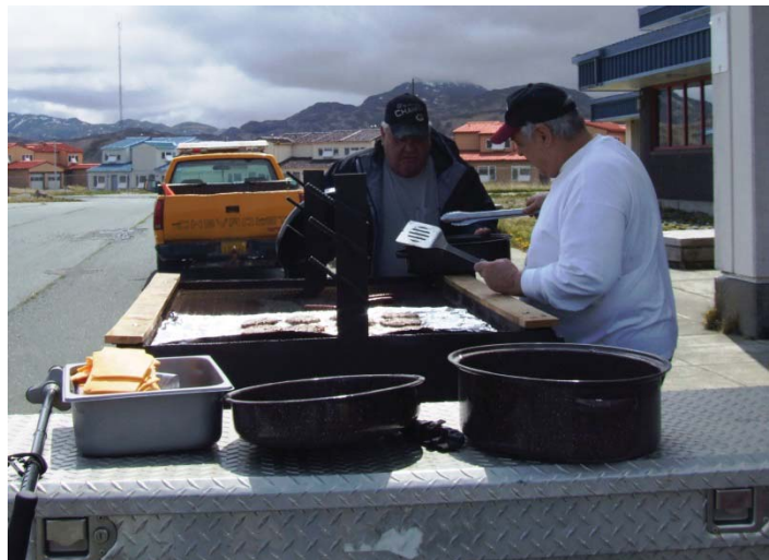
The BBQ, is a home town wonder made here on Adak. The BBQ was built on a trailer has an electric rotisserie and truck tool box for storage and table.