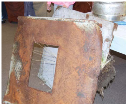
Most interesting Piece of Trash

A special thanks to the City of Adak Public Works crew for picking up all those darn bags and piles of trash we collected.