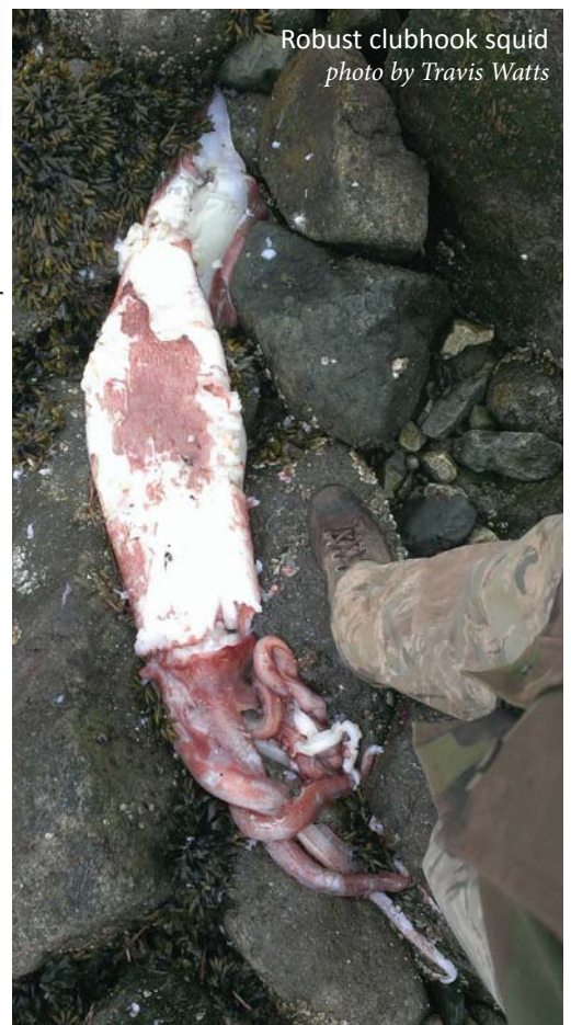
Robust clubhook squid

Last month turned up three interesting creatures on Adak's beaches. One was a robust clubhook squid ( Onykia robusta , above and right), which is the largest squid occurring in our area--the mantle alone can reach six and a half feet. These guys wash ashore on Adak every year or so, and have often mistakenly been called giant squid. Indeed, they can be gigantic (their mantles are about the same length as a giant squid's, though their tentacles and arms are proportionally much shorter), but they are in a different family than the infamous Architeuthis . Little is known of the life history of these squid, but they are generally found at depths greater than 1,600 feet, where they feed on fish and squid. Like other squid, they have eight arms with suckers and two long feeding tentacles, the ends (or clubs) of which are specialized in various ways. As their name suggests, clubhook squid have two rows of distinctive hooks on the tentacular clubs. Another distinguishing feature of a robust clubhook squid is its textured pinkish-purplish mantle skin, striated with longitudinal ridges, and its very large fins.