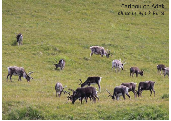
Caribou on Adak

Why is the U.S. Fish and Wildlife Service (USFWS) killing caribou on Kagalaska Island? Here's a bit of history to help explain it. Barren-ground caribou calves from the Nelchina herd were captured, held in captivity, and released on Adak in 1958 and 1959 to provide recreational hunting opportunities for military personnel stationed on the island. Adak is 500 miles outside the native range of caribou, but the introduction was successful and the herd quickly became established on the island. Surveys conducted opportunistically with military and U.S. Coast Guard aircraft estimated the population at approximately 300-400 animals throughout much of the 1980s, when there were about 5,000 people living on the island. When the military base closed in 1997, hunting declined sharply, and the caribou population exploded: we counted about 2,700 animals in 2005 and 2012.