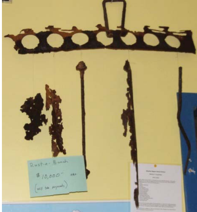
Winner Trash Art: Rust – a – Bunch