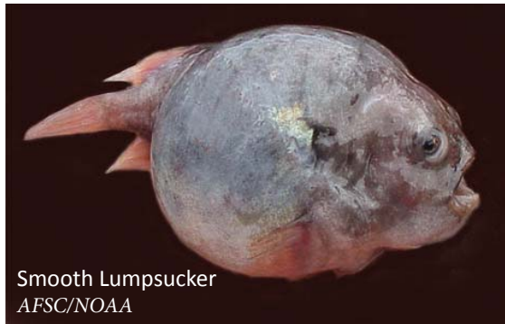
Smooth Lumpsucker

Another creature to wash ashore was a funny little round fish called a smooth lumpsucker ( Aptocyclus ventricosus , left). The ones we find on Adak are generally about the size of a large softball, scaleless, drab and spherical. Their pelvic fins have evolved to form a strong sucking disk on their undersurface, which holds the fish firmly to the bottom of the sea. They are, literally, lumps with suckers.