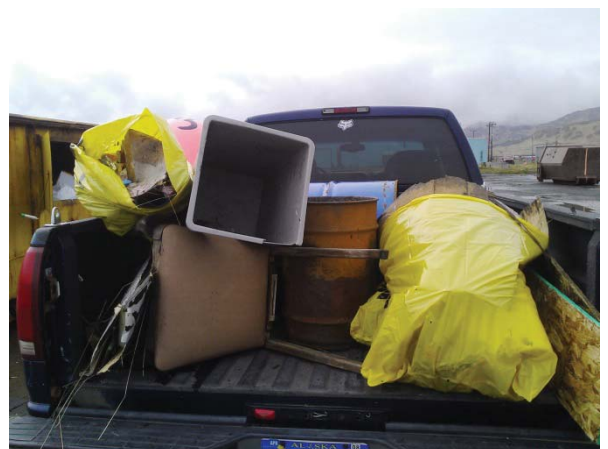
Heaps of trash (r)