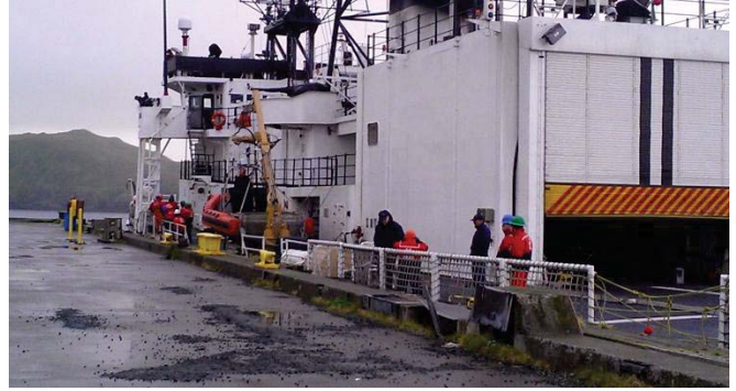
Getting ready to leave port