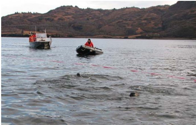
Researchers attempt to tangle seals in nets set around their haulout.

Photos below are from an ADFG project on Kodiak, but methods pictured will be similar to those used at Clam Lagoon.