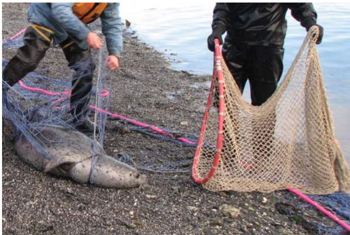
Researchers untangle a captured seal and transfer it to a holding net.