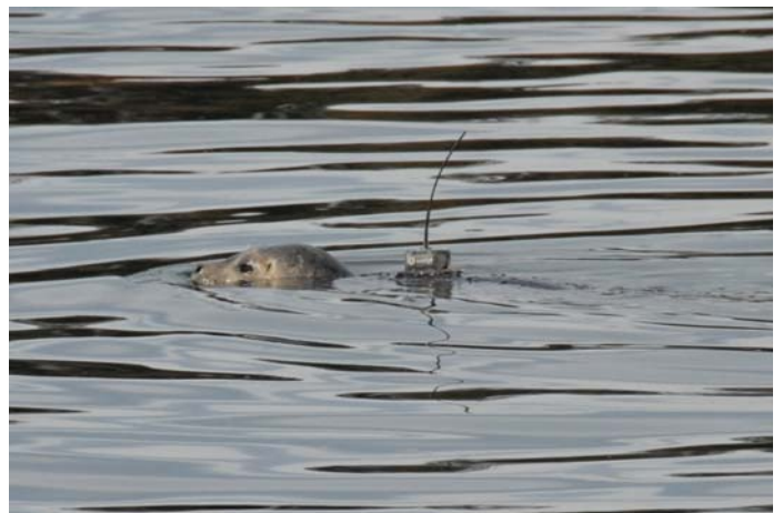
A released harbor seal with back-mounted satellite tag.