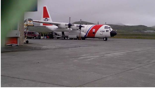
C130 brings much needed supplies