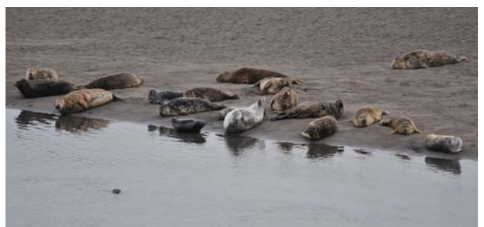
Harbor seals in Clam Lagoon.