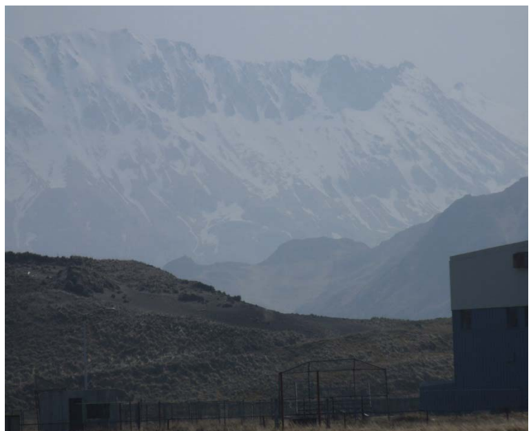
The mountains behind a vale of unexplained smoky haze

The National Weather Service called at 1:30 pm stating they were still searching for a cause to the conditions. While they have high resolution satellite imagery, they were not able to see Adak or the other western islands through the cloud cover. Interesting, it was sunny here. In the meantime, the very next day Adak experienced gale force winds and lots of rain. Mystery is unsolved.