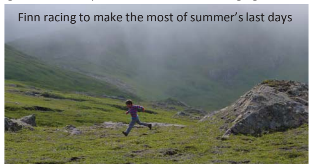
Finn racing to make the most of summer's last days

Fireweed and monkshood in bloom: take heed! Summer is really almost over, so get out and enjoy Adak's hills and dales while the weather is still mild, the slopes still green, longspurs still singing, and the blueberries growing ever more firm and sweet. Enjoy!!!